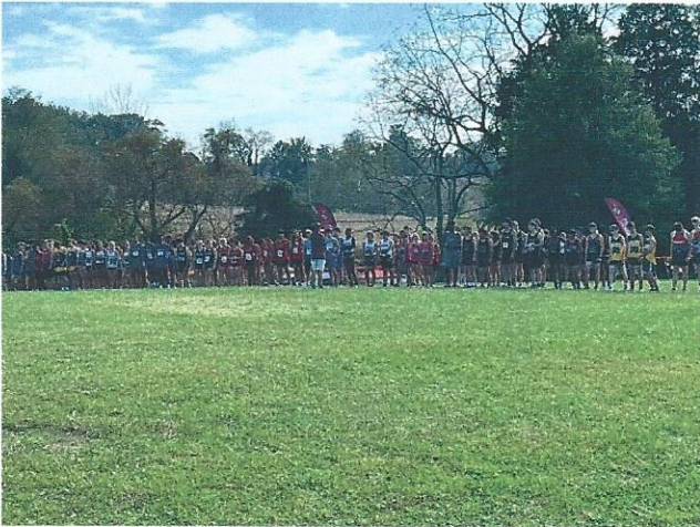
On your marks ...!

October 16, 2021 was the tenth running of the Gunpowder Invitational Maryland Public School (GIMPS) Cross-country Race at the historic Jerusalem Mill Village. Over 500 runners from 22 high schools participated in the event, in perfect weather.