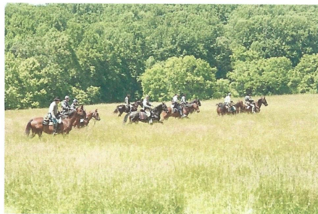
Gilmor's Raid Reenactment.