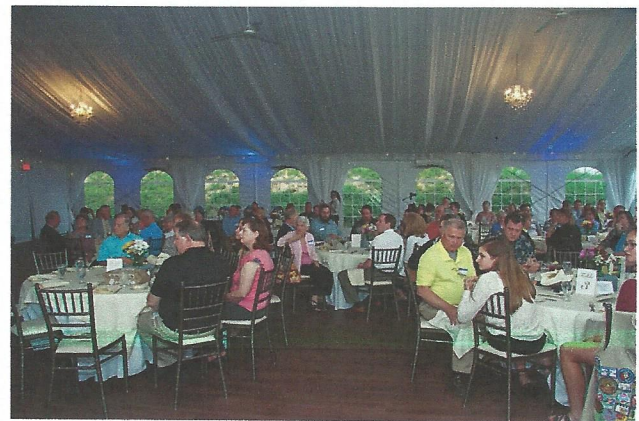
Spring Dinner

On Friday May 4 th , the Friends of Jerusalem Mill held its annual Spring Dinner at Mountain Branch.