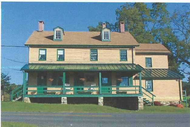
The general store in September, 2015

Today the front room (or parlor) of the residence section includes information on the Gilmore Raid as well as other events in Harford County, reflecting the split in sentiment which existed at the time. In this room, the Civil War aficionado can find plenty of information to hold their interest.